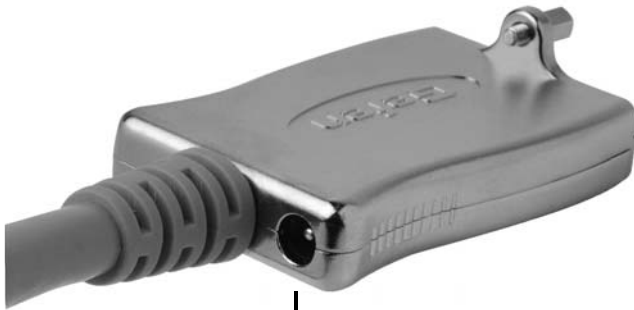
Rear of Female Side Showing 5V Power Jack for the included Power Supply